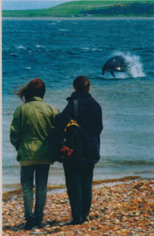
A Cromarty dolphin

When Cromarty's trade flourished at the end of the 18th century, large houses were built for successful merchants, side by side with the cottages of the fisher folk. This once busy port and commercial centre is now a uniquely preserved historic town.