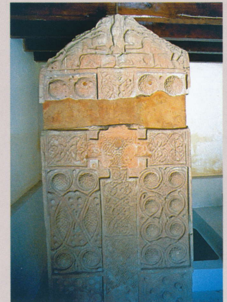
The Nigg cross-slab

The ninth century Nigg cross-slab, housed in Nigg Old Church, is a major work of European art and is part of the Pictish Trail.