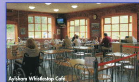
Aylsham Whistlestop Café