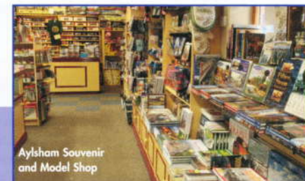
Aylsham Souvenir and Model Shop