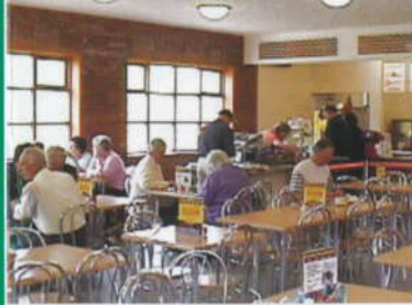
Aylsham Whistlestop Restaurant

For more information call in to Aylsham Station or ring 01263 733858. *Restrictions apply.