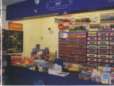
Aylsham Souvenir and Model Shop